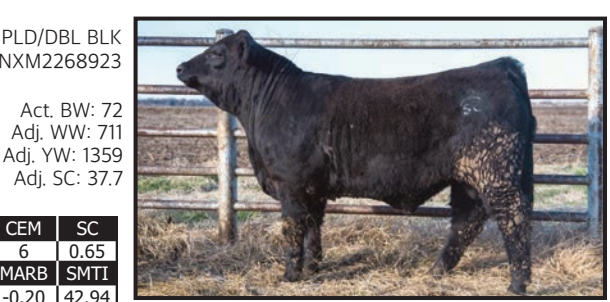
SC GABRIEL 368G

A solid prospect for any operation is GABRIEL. He has the look, structure, and mass to complement a diverse cow family. His balanced genetic script and renounced pedigree speak for themselves.