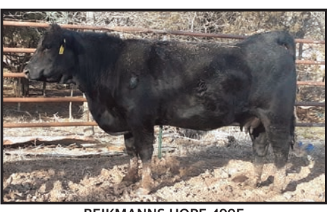
BEIKMANNS HOPE 499E

A lot of growth and performance in this first calf heifer. She is strong-topped and thick, She has a neat made bull calf NXM2270022 at side out of EXLR SLIP CLUTCH born 2-13-20 at 75# Tattoo #BEIK499H.