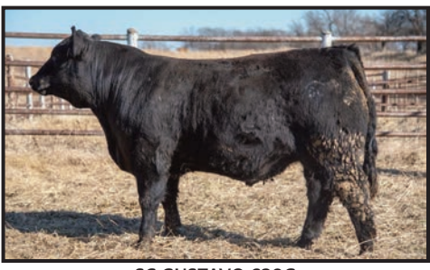
SC GUSTAVO 620G

This Excessive Force son in the top 25% for birthweight yet quick to put the pounds on, so his progeny will give a quick return on investment. He's a heavy muscled, durable footed bull that is built for the long haul.