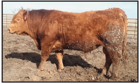
BEIKMANNS FARMER RED 280F

280F is out of one of the best red purebred cows in our herd, Beikmann's Glenda 280Z, He is a half brother to Lots #6 and 25