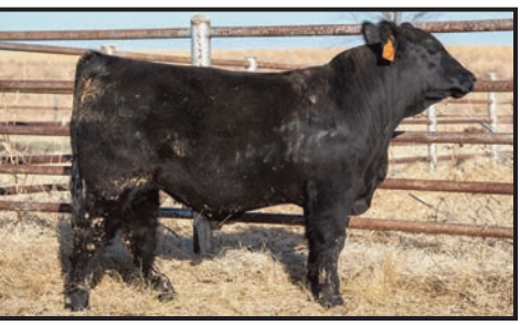
SCAS GRANGER 501G

This CUPID son is the spitting image of his sire; high tying, smooth shouldered with great lines and an attractive yet functional hind leg. His impressive calving ease and maternal figures makes him the ideal heifer bull.