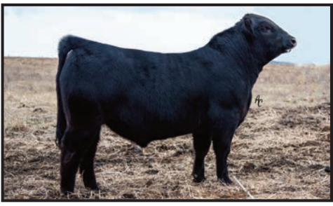
SCAS FOREFRONT 126F

This Double Black son comes from the heart of our program. His Dam was a many time Champion that has continued her success to the donor pen. This sound sturctured, bold bodied bull is made for the long haul. Plus his smooth shoulder, combined with his low birthweight makes a good combo to cover heifers. He's sure to be at the forefront of your program.