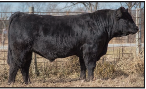
SCRN FLETCHER 353F

This bull is a mack truck, he's the rugged stout made bull that can still handle his power. He's equipped with a big durable foot that allows him to handle any environment while covering cows.