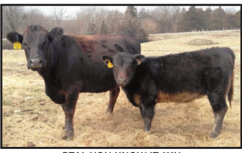
PTAL YOU KNOW IT 111Y

A good producing cow that goes back to a Wluf's Guardian daughter that we purchased from Potter Limousin in South Dakota, Lot #18A PTAL GRACIE 911G at her side is a nice-looking heifer calf that might make a nice 4-H show heifer. Calf is Black/Polled, born 8-26-19 at 77# and sired by KGUM PTAL DAIQUIRI 613D, a MAGS AVIATOR son out of AUTO BARLIE 413B. This cow was another one of Kaylee's good show heifers purchased from Pinegar Limousin, PTAL YOU KNOW IT 111Y is pasture exposed from 11-30-19 to present to KGUM PTAL DAIOUIRI 613D.