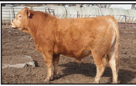
BEIKMANNS FIREHOUSE 284F

284'S Dam, 284Z, has done a tremendous job. She has never missed in the last 8 years, Half brother to Lot #4.