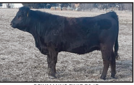
BEIKMANNS FIXIE 704F

PE 5-10-19 till 10-3-19 to #LFM2270066 BEIKMANN'S EMERALD 1019E. Her sire SLIP CLUTCH is very predictable when it comes to calving ease and making quality females. She goes back to a Polled Manhattan cow 316. She raised calves into her late teens.