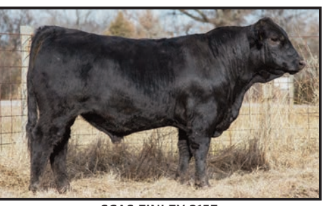
SCAS FINLEY 215F

This purebred bull has the Limousin traits to hold up his side of any cross; he's a heavy muscled, big bodied bull that's high performing. Yet, he won't sacrifice the other side, since he's in the top 20% of the breed for his marbling.