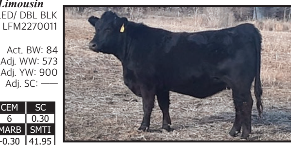
BEIKMANNS ELVERA 497E

AI'd 5-5-19 to #NPM2051329 SYES BACKSTAGE 466B. Then PE 5-10-19 till 10-3-19 to #LFM2270066 BEKMANN'S EMERALD 1019E. Her sire might be the best embryo flush I have ever done, EMBLAZON to TUBB JASMINE. ELVERA is half sister to Lots #2 and 6.