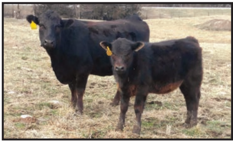
PTAL DAISY 601D

PTAL 601D is a Purebred Limousin out of PTAL ZOEY 208Z and SYES BEST BUY. She was born 2-13-16 at 44#. Lot C32A at her side is PTAL 914G, a Purebred Black and Polled heifer born 9-6-19 at 58# and her sire is KGUM PTAL DAIQUIRI 613D. PTAL 601D is PE from 11-30-19 to present to KGUM PTAL DAIQUIRI 613D (MAGS AVIATOR/AUTO BARLIE 413B). This is 601D's second calf. Her first calf was Black bull which weighed