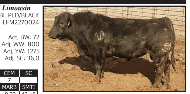
BEIKMANNS FREEWAY 365F

Freeway has been a scale masher. Will add pounds and profit to your calf crop, Half brother to Lot #5.