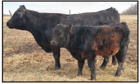
KGUM ARIAL 316A

This one has style, big framed, structurally correct out of one of Kaylee's show heifers that she won many shows with, PTAL YOO HOO. Lot #19A at side is PTAL GENERAL 913G, a 9-3-19 Black, Polled bull calf with BW of 86# sired by KGUM PTAL DAIQUIRI 613D (MAGS AVIATOR/AUTO BARLIE 413B). KGUM ARIAL is PE 11-30-19 to present to KGUM PTAL DAIQUIRI 613D.