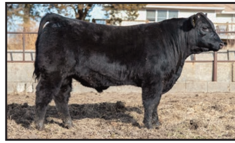
SCAS FERNAO 935F

Don't miss out on an opportunity to purchase a bull that comes from a champion female and historic bull lineage. His outstanding growth numbers, impressive maternal script and solid terminal figures showcase how unique this bull is. From the ground up he's a durable footed, flexible bull that's stout made and good bodied.