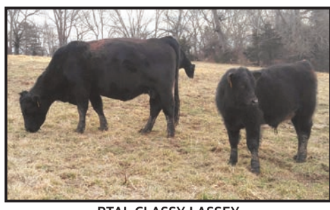
PTAL CLASSY LASSEY

Here is another daughter of PTAL YOO HOO, Kaylee's old show heifer who was the high selling cow/calf pair in the 2019 sale, This one is more moderate framed than her half-sister KGUM 316A LOT #19, but is out of WULF ZANE X238Z, which was one of the top 150 of all breeds for feed efficiency in the whole country. Lot #21A - At her side is PTAL GRANITE 912G; a Black, Polled bull calf which was born at 8-27-19 at 95# sired by KGUM PTAL DAIQUIRI 613D (AVIATOR x AUTO BARLIE 413B). KGUM CLASSY LASSEY is PE 11-30-19 to present to KGUM PTAL DAIOUIRI 613D.