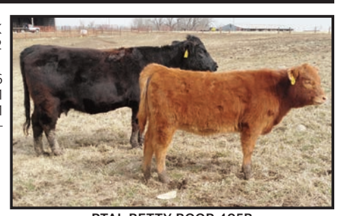
PTAL BETTY BOOP 405B

CEM CFD BW WW 0.5 51 76 6 0.40 DOC | CW REA MARB SMTI EPD <sub>S</sub> 6 0.97 | -0.69 | -0.36 | 37.99